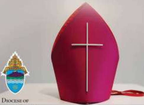
DIocese of COLORADO SPRINGS

We ask this through the intercession of Our Lady of Guadalupe, patroness of the Diocese of Colorado Springs, and in the name of Jesus Christ, our Lord. Amen.